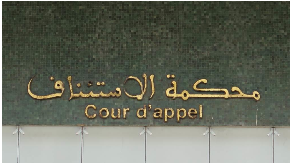
Photo: Agadir Court of Appeals whose landmark ruling in August 2014 overturned a conviction based on a torture-tainted police interrogation report.

In a rare decision, the Criminal Chamber of the Agadir Court of Appeals quashed a guilty verdict for drugs charges against a detainee who alleged torture, in August 2014. The court granted a medical examination which was performed in the Guelmim military hospital. It concluded that he had been tortured in garde à vue detention including though beatings, blows to the head that perforated his eardrum, and cigarette burns, following his arrest in Guelmim in June 2014. Authorities announced an investigation into the alleged torture, and have yet to make conclusions public.